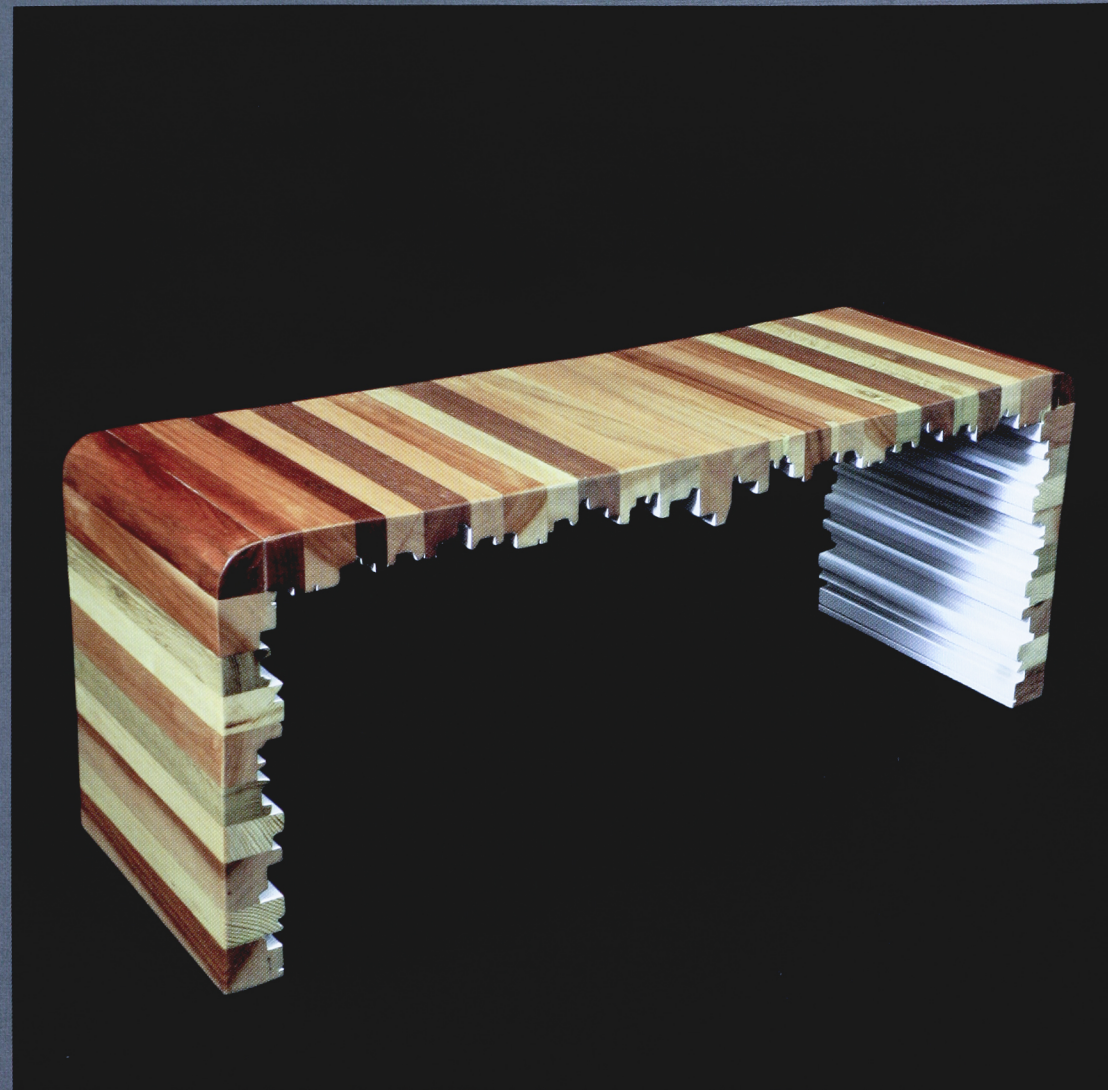
VERSATILE © NICOLAS LE NOCHER / FRANCE